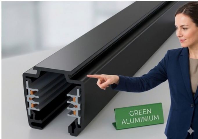
Product information "Unipro Aufbaustromschiene 2m"